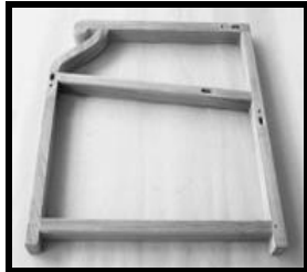
RIGHT END FRAME