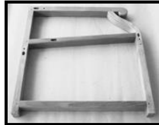
LEFT END FRAME