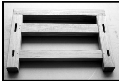
LEFT END FRAME