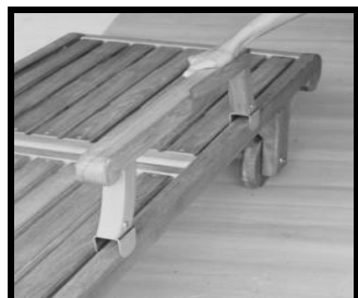
RIGHT AND LEFT ARM

Unpack, inspect and lay the parts on a clean, flat, soft surface to avoid marring the wood.