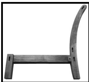
RIGHT END FRAME