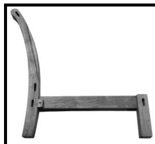
LEFT END FRAME