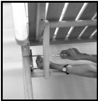
RIGHT AND LEFT ARM

Unpack, inspect and lay the parts on a clean, flat, soft surface to avoid marring the wood.