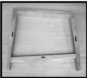
RIGHT END FRAME