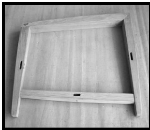
LEFT END FRAME